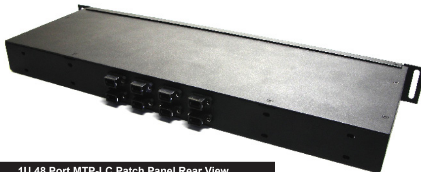
1U 48 Port MTP-LC Patch Panel Rear View