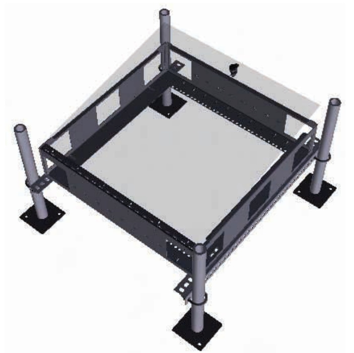
Under Floor Frame mounted to risers