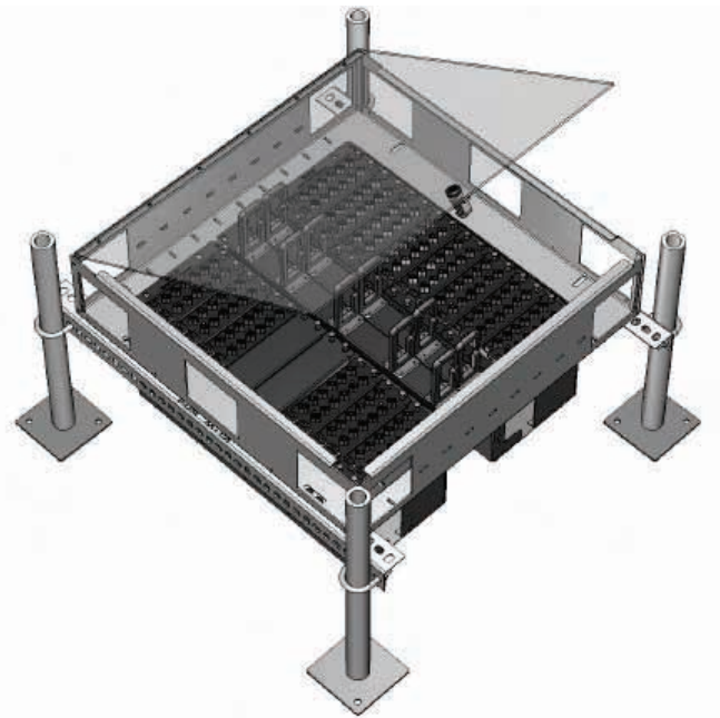
Shown with (2) 4U LC Enclosures and Wire Management