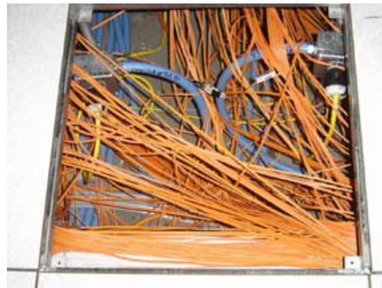
Figure 2. Cluttered, long sub-floor cable runs are hard to manage, generate immense heat, waste space, and make it increasingly more difficult to manage the SAN cable infrastructure over time.