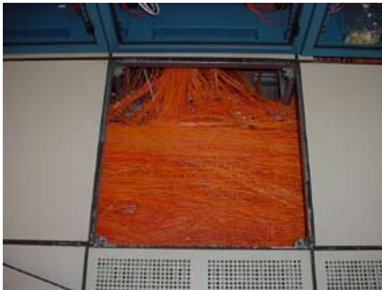
Figure 1. Does your SAN infrastructure look like this?

Owners and operators of data centers with structured fiber cable know that, in the end, it's not "Fiber" that provides the value, but in fact how the structured cabling solution is designed and implemented that will enable the data center to reduce risks, save time and money, and effectively evolve the data center. In addition to these primary benefits, these data centers are experiencing environmental benefits and other valuable secondary rewards from their properly deployed fiber connectivity solutions.